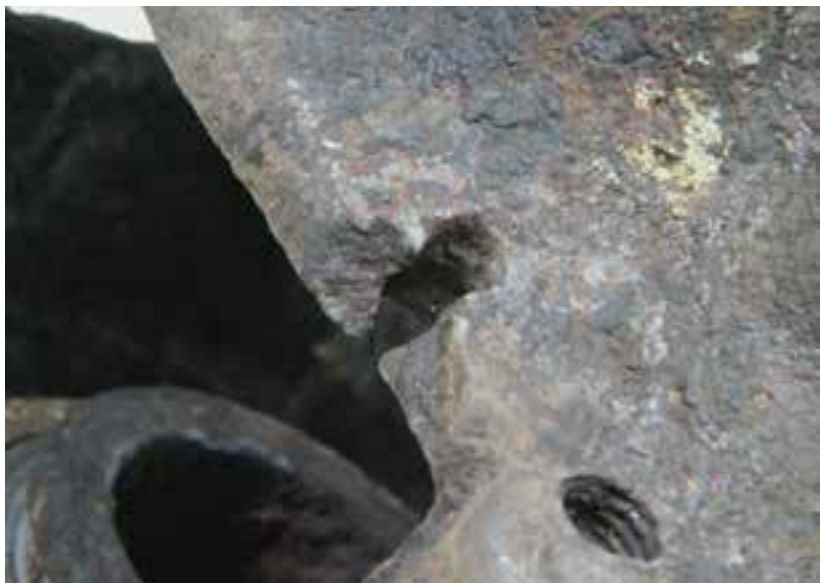
CODE: BPH BROKEN PIN HOLES ORIFICIOS DE PASADOR QUEBRADOS