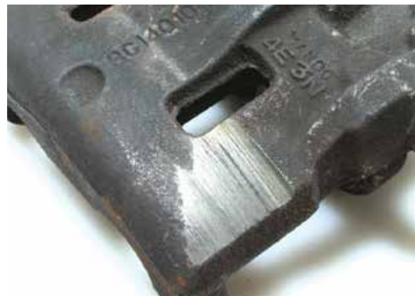
CODE: SW SCORED BY WHEEL DESGASTADO POR LA RUEDA