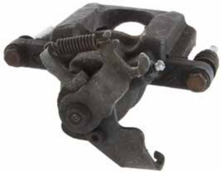
CODE: MB MISSING BRACKET SIN SOPORTE

NO CORE CREDIT WILL BE ISSUED IF ANY OF THE FOLLOWING CONDITIONS EXIST NO SE EMITIRA CREDITO SI EXISTE ALGUNA DE LAS SIGUIENTES CONDICIONES EN EL CALIPER