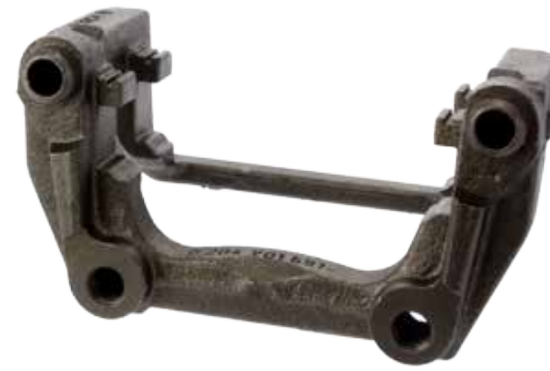
CODE: MH MISSING HOUSING SIN CUERPO