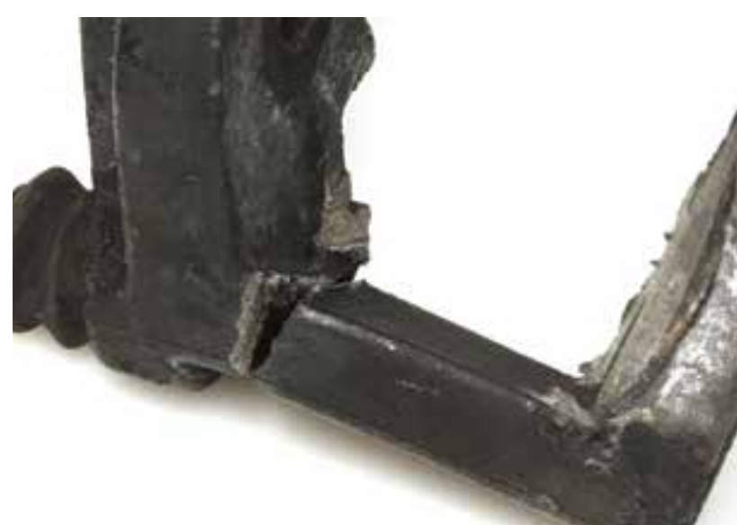
CODE: CB CRACKED BRACKET SOPORTE FRACTURADA