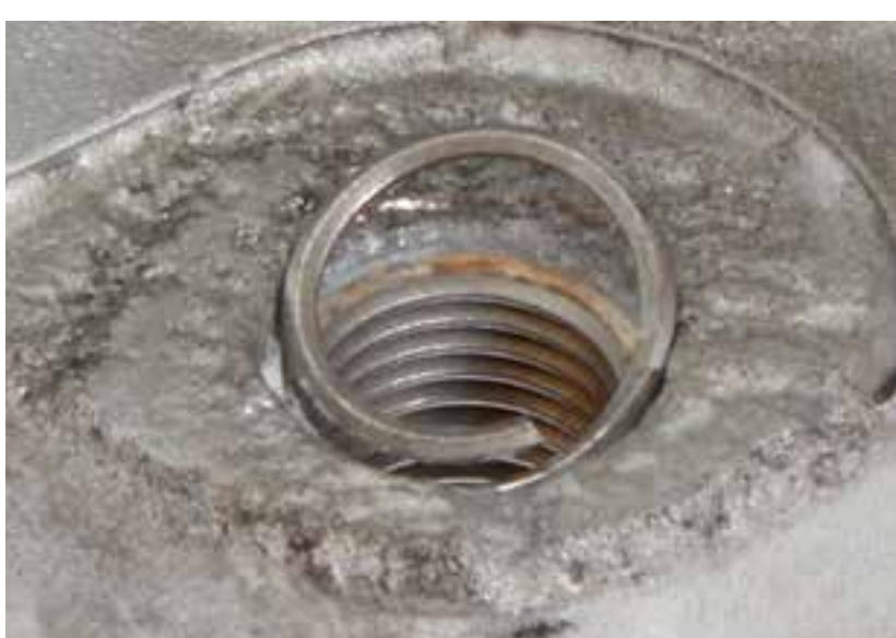
CODE: TM THREADS MODIFIED ROSCAS MODIFICADAS