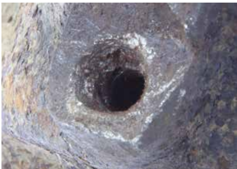
CODE: TS THREADS STRIPPED ROSCA DAÑADA