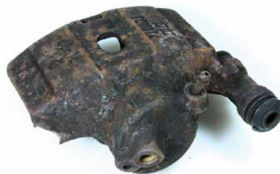
CODE: BC BROKEN CASTING CALIPERS QUEBRADOS E INCOMPLETOS