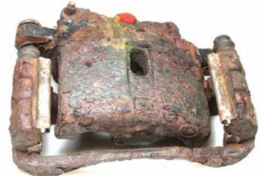
CODE: PC PITTED CASTING/ EXCESSIVE CORROSION CORROSION EXCESIVA EN LA FUNDICION