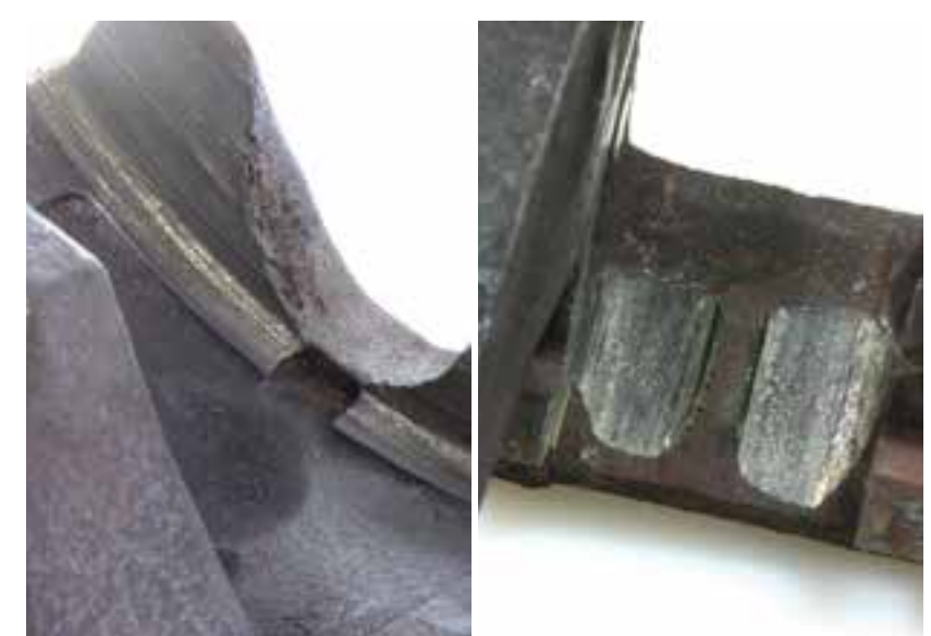
CODE: SR SCORED BY ROTOR DESGASTADO POR DISCO

REFER TO PART NUMBER LABEL FOR DETAILS ON REQUIRED COMPONENTS TO RECEIVE FULL CORE CREDIT REFERIRSE AL NUMERO DE ETIQUETA PARA IDENTIFICAR LOS DETALLES EN COMPONENTES PARA RECIBIR EL CREDITO COMPLETO