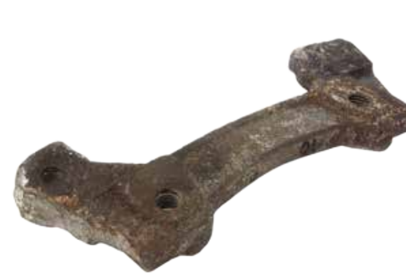
CODE: BB BENT BRACKET SOPORTE DOBLADO