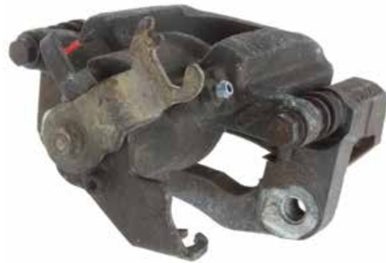
CODE: MS MISSING SPRING SIN RESORTE