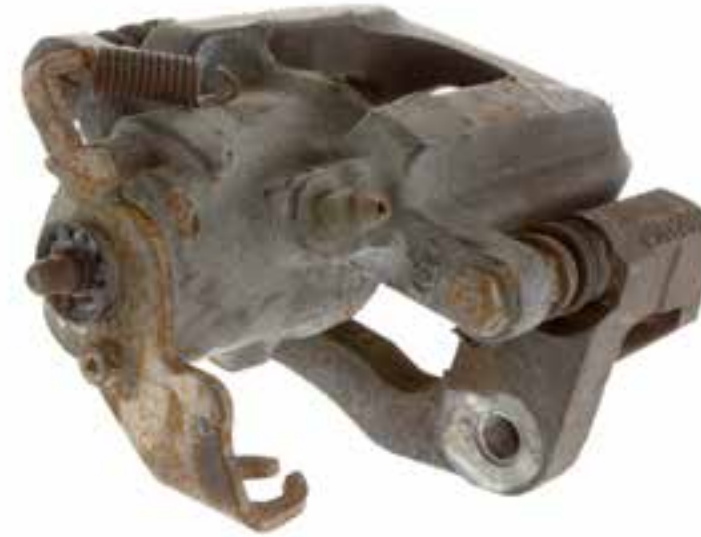
CODE: ML MISSING LEVER SIN PALANCA