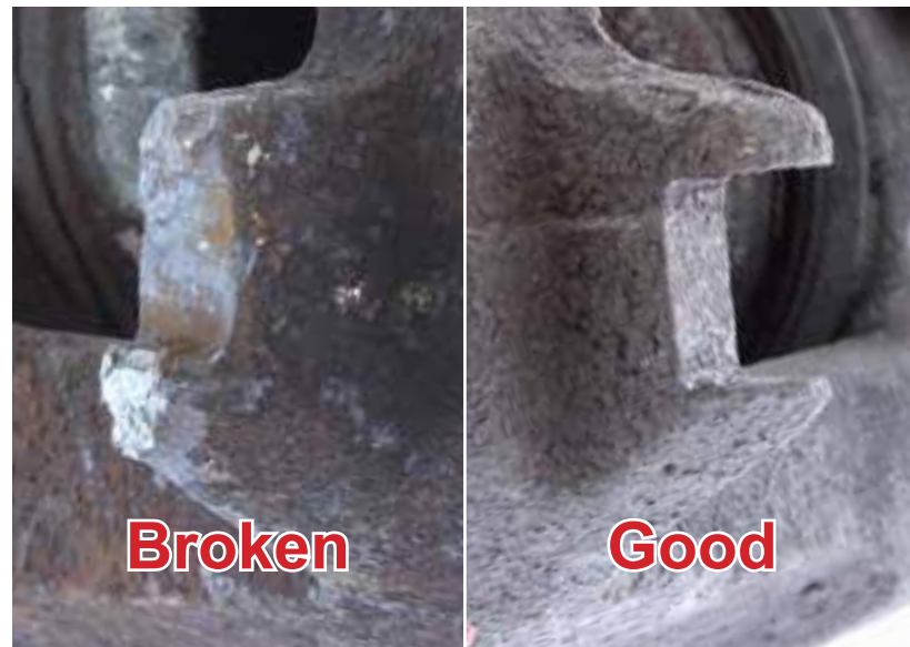
CODE: BT BROKEN TABS PORCIONES QUEBRADAS