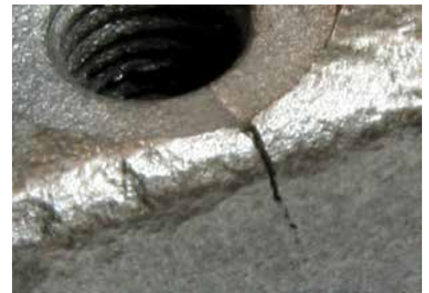
CODE: CC CRACKED CASTING FUNDICION FRACTURADO