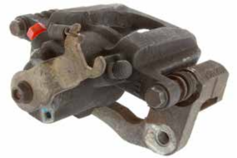
CODE: MG MISSING CABLE GUIDE SIN GUÍA DE CABLE